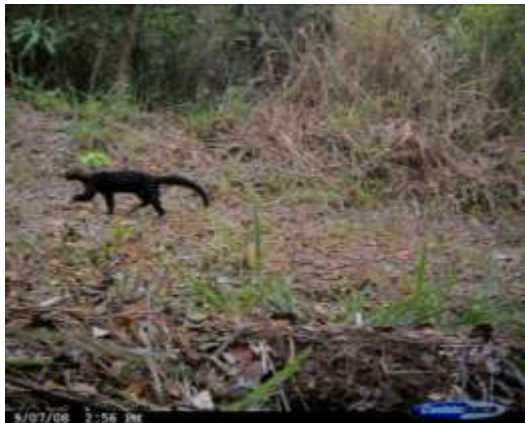
Photo 8- Eira barbara Matt head moving