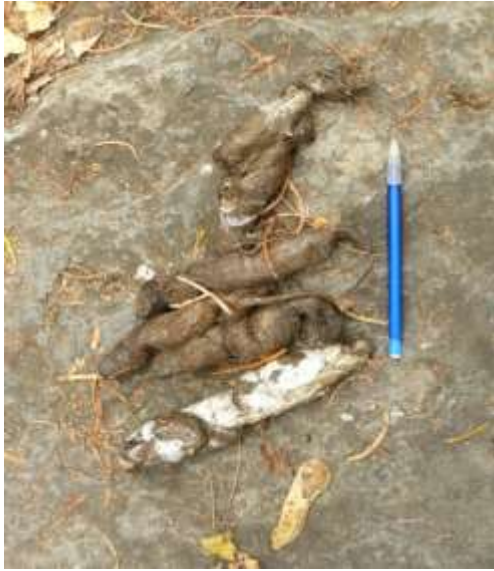
Photo 1- Panthera onca centralis coastal Jaguar excrete found in the Candil creek (transect 3).