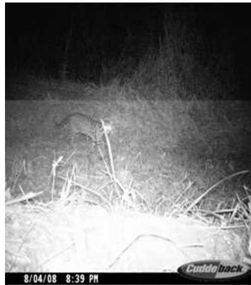
Photo 4- Leopardus pardalis margay moving, while observing the trap camera.