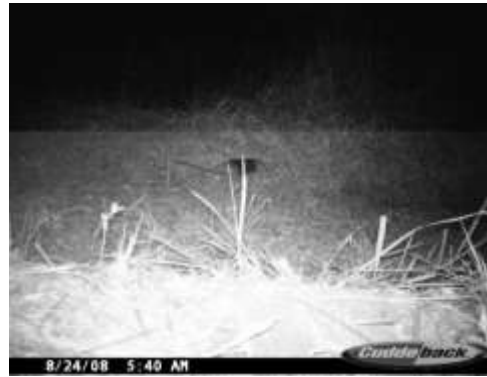
Photo 6- Tamandua mexicana Anteater bear Tamandua mexicana in nocturnal activity