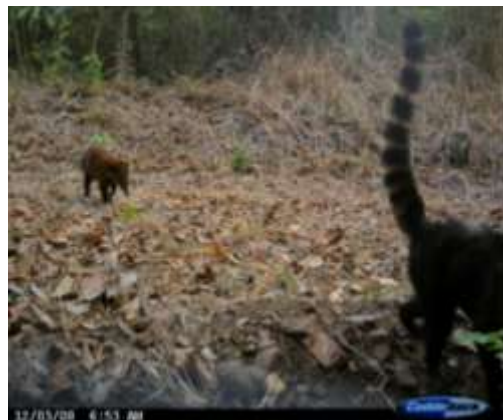
Photo10.- Agouti or coatis Nasua narica .