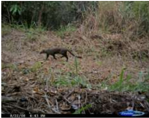
Photo 5- Puma yaguaroundi Jaguarundi moving