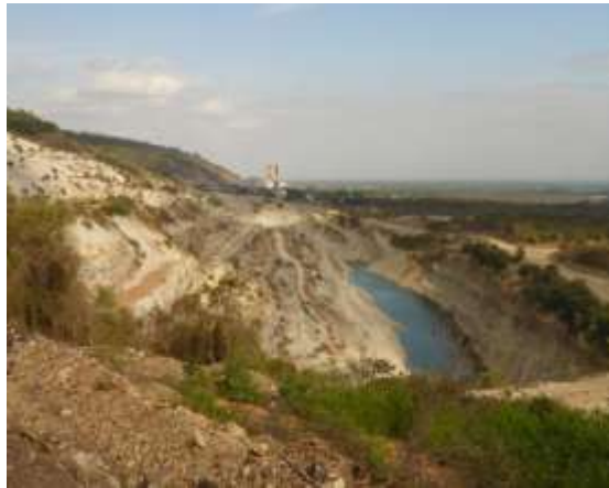
Photo 15- On the left bank of the man-made lagoon traces of feline in two inspections in HOLCIM were observed