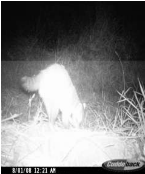
Photo 3- Procyon cancrivorus raccoon in night time activity, probably feeding.