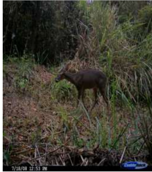
Photo 2- Odocoileus peruvianus white-tailed deer moving front trap camera.