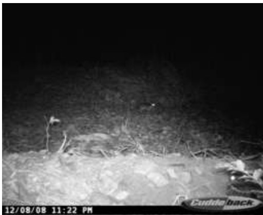
Photo 9- Sylvilagus brasiliensis rabbit moving in evening activities, there is the brightness of her eye in the center of the image to the right.