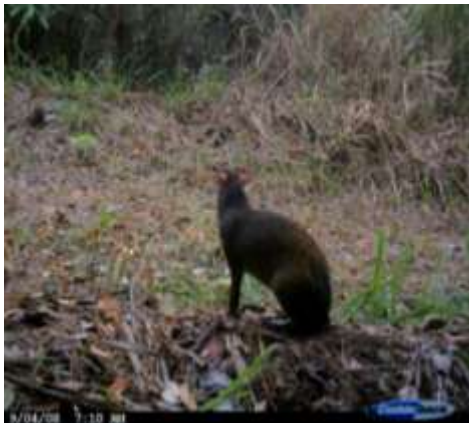
Photo 7- Dasyprocta punctata Guatusa observing another individual of its species a few meters to the left.